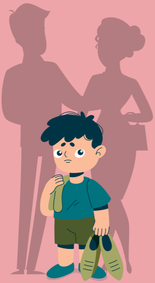
Intentionally abandoning children.