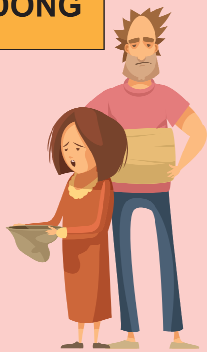
Leasing, lending, or forcing children to go begging.