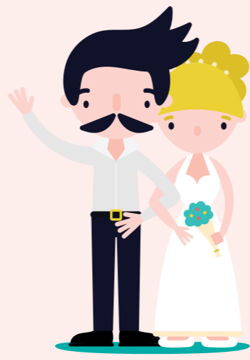
Forcing children into child marriage.