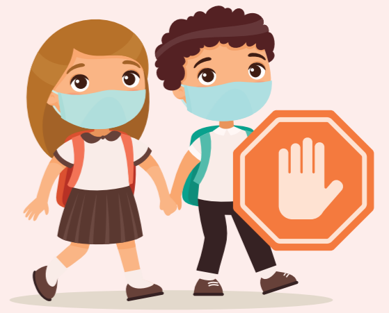
Forcing children to drop out of school.