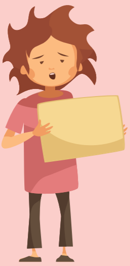
Not caring and nurturing children.