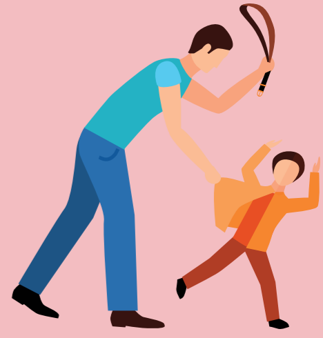
Scolding, threatening, isolating children.