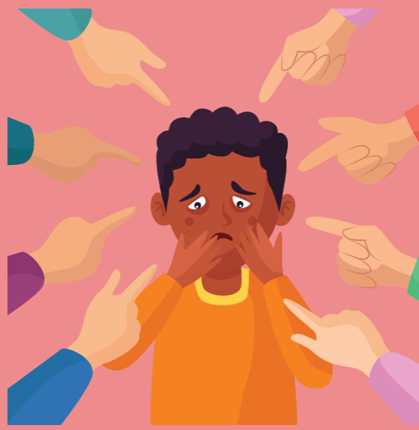
Failing to intervene when children are abused.