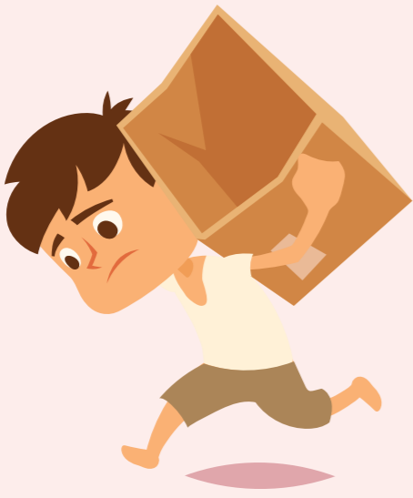
Forcing children to work too hard.