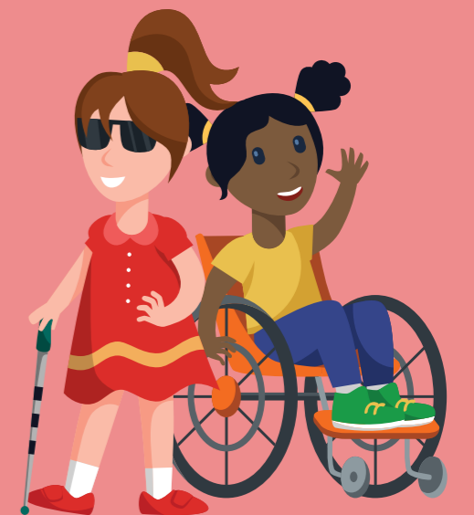
Failing to provide custody for children in special situations.