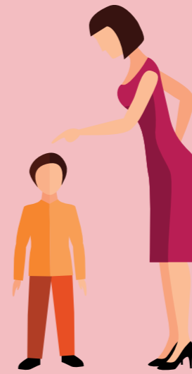
Forcing children to abstain from eating and drinking.