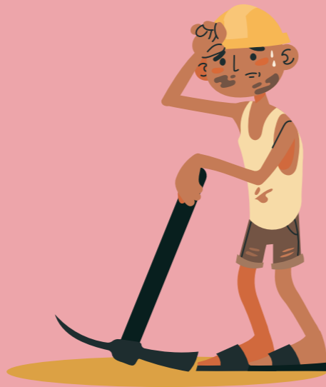
Exploiting child labour.