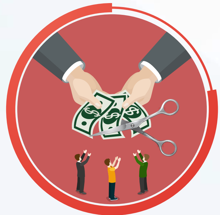
Deducting wage in lieu of a disciplinary measure.