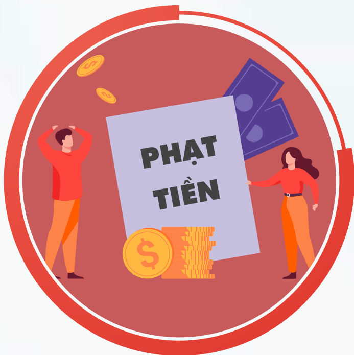
Applying monetary fines in lieu of a disciplinary measure.