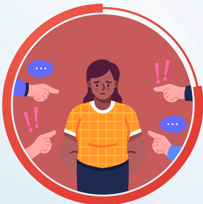
Infringing the health, honour, life, prestige or human dignity of employees.