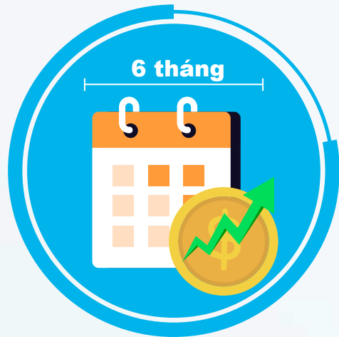
Deferment of wage increases (no longer than 6 months)